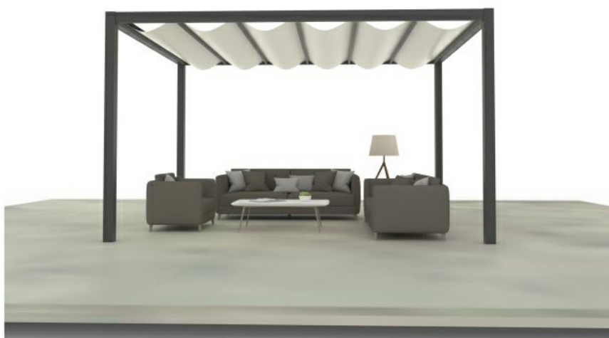
Display from multiple perspectives